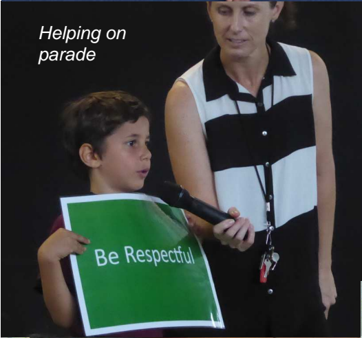
Helping on parade