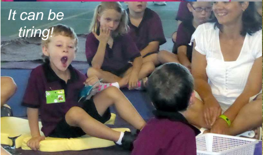
It can be tiring!