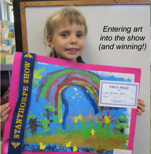
Entering art into the show (and winning!)